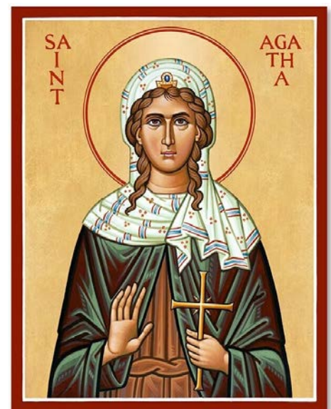
St. Agatha Pray for us

Cita: Oh Señor, que me hiciste y creaste, y me guardaste desde mi infancia,... que me quitaste el amor del mundo, que guardaste mi cuerpo de la contaminación, que me hiciste vencer los tormentos del verdugo, el hierro, el fuego y cadenas, que me diste la virtud de la paciencia en medio de los tormentos, te ruego que recibas mi espíritu. ~ 1529 Breviario romano