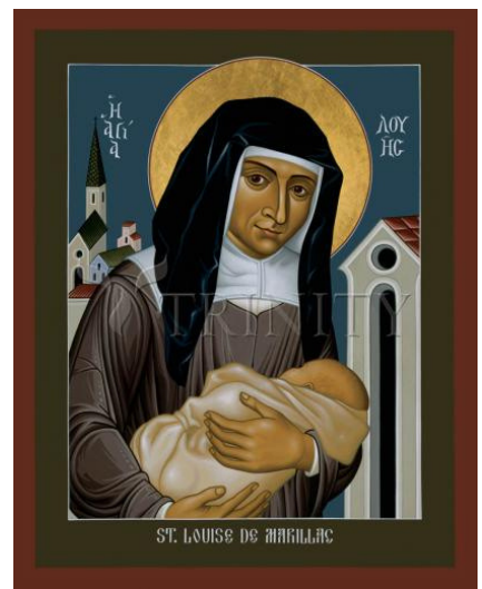
St. Louise de Marillac Pray for us