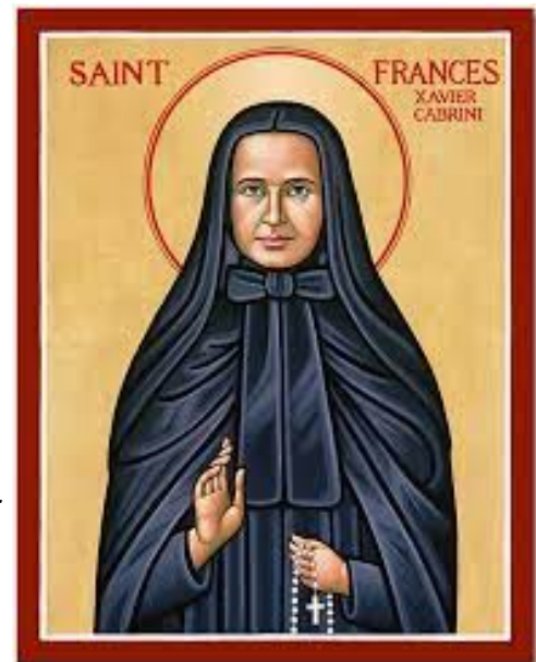
St. Francis Xavier Cabrini Pray for us

Santa Francisco Javier Cabrini nació en el norte de Italia en 1850. Se convirtió en maestra de escuela, religiosa y fundó las Hermanas Misioneras del Sagrado Corazón. A medida que su orden crecía, se la animó a enviar hermanas al oeste para ministrar a los inmigrantes en Estados Unidos. Junto con sus hermanas, la Madre Cabrini instaló escuelas, orfanatos y hospitales en toda América, así como en Brasil, Nicaragua, Argentina e incluso Inglaterra, Francia y España. Se la recuerda con cariño diciendo: "El Corazón de Jesús hace las cosas con tanta prisa que apenas puedo seguirle el ritmo". Fue canonizada en 1946 por Pío XII.