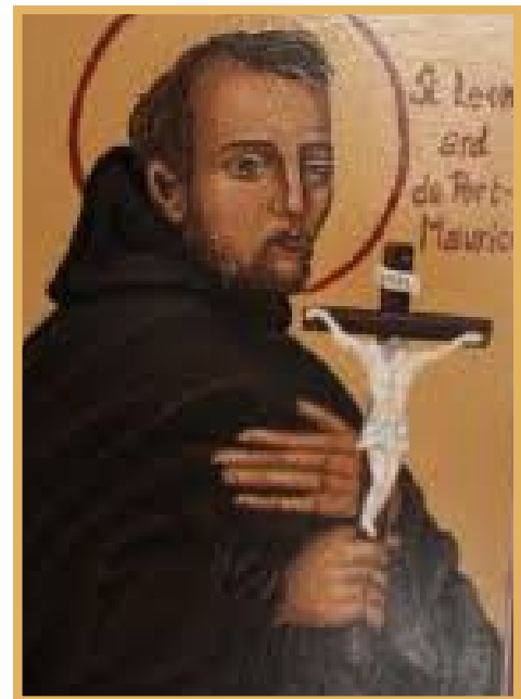
St. Leonard of Port Maurice Pray for us

San Leonardo nació en Porto Maurizio en 1676, hijo de un maestro marino. Era un fraile franciscano de la Estricta Observancia que vivía en el monasterio de San Buenaventura en Roma. Predicó sobre la devoción al Santísimo Sacramento, el Sagrado Corazón de Jesús, la Inmaculada Concepción de María y el Vía Crucis, llegando incluso a construir casi 600 estaciones en Italia, incluida una en el Coliseo. Fue ordenado sacerdote en 1703 y se convirtió en un solicitado predicador de misiones y retiros parroquiales. La tensión de sus trabajos misioneros y sus mortificaciones lo habían agotado por completo cuando murió en 1751 en su convento.